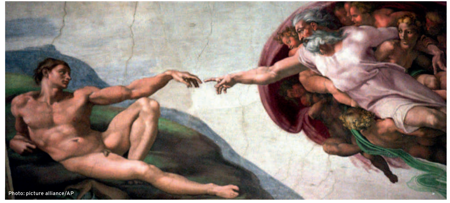
Michelangelo's fresco "The Creation of Adam," in the Sistine Chapel in Rome, Italy